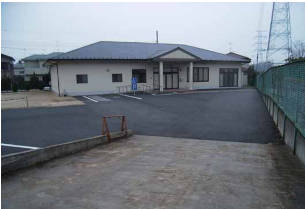
Heiwadaï Residents' Association Center

■ Contact : Public Interest Activities Support Section, Phone 7185-1111, Ext.434