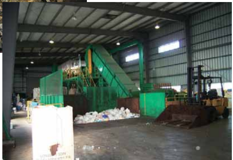
Inside of Clean Center