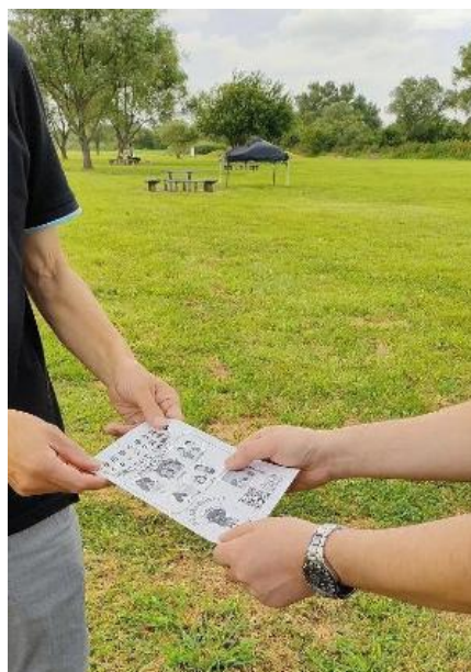
The state of the enlightenment handbill distribution