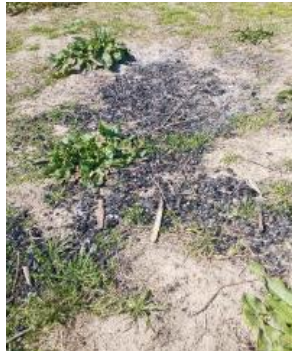
The state by which charcoal is thrown away

It's to receive everybody's understanding and cooperation, and it becomes possible to open a square for free of charge. Please defend a rule and manners and use it for safety and comfortableness also to have many persons use it from now on.