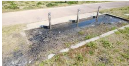
The state by which charcoal is thrown away in a water place