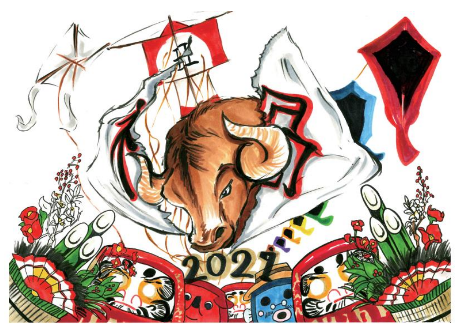
Illustration by Daichi Tanaka, Abiko junior high school. This illustration was selected from 26 entries at 14 elementary and junior high schools in the city.

Excerpts of the Newsletter issued by Abiko City Phone:04-7185-1111