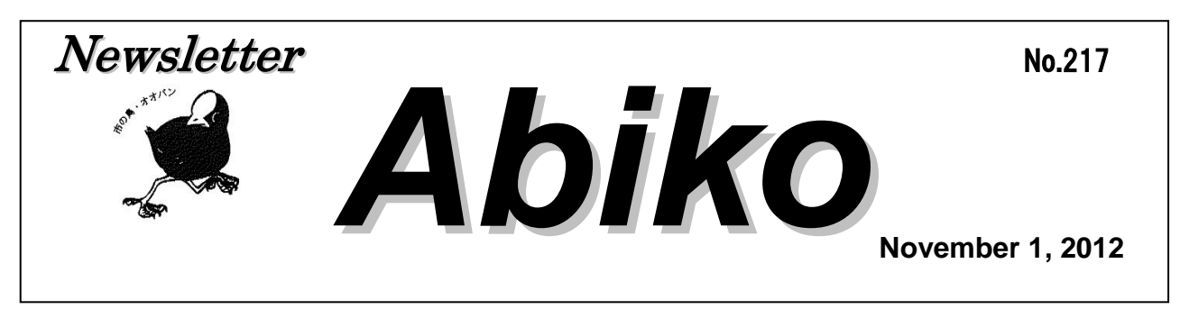
Excerpts of the Newsletter issued by Abiko City